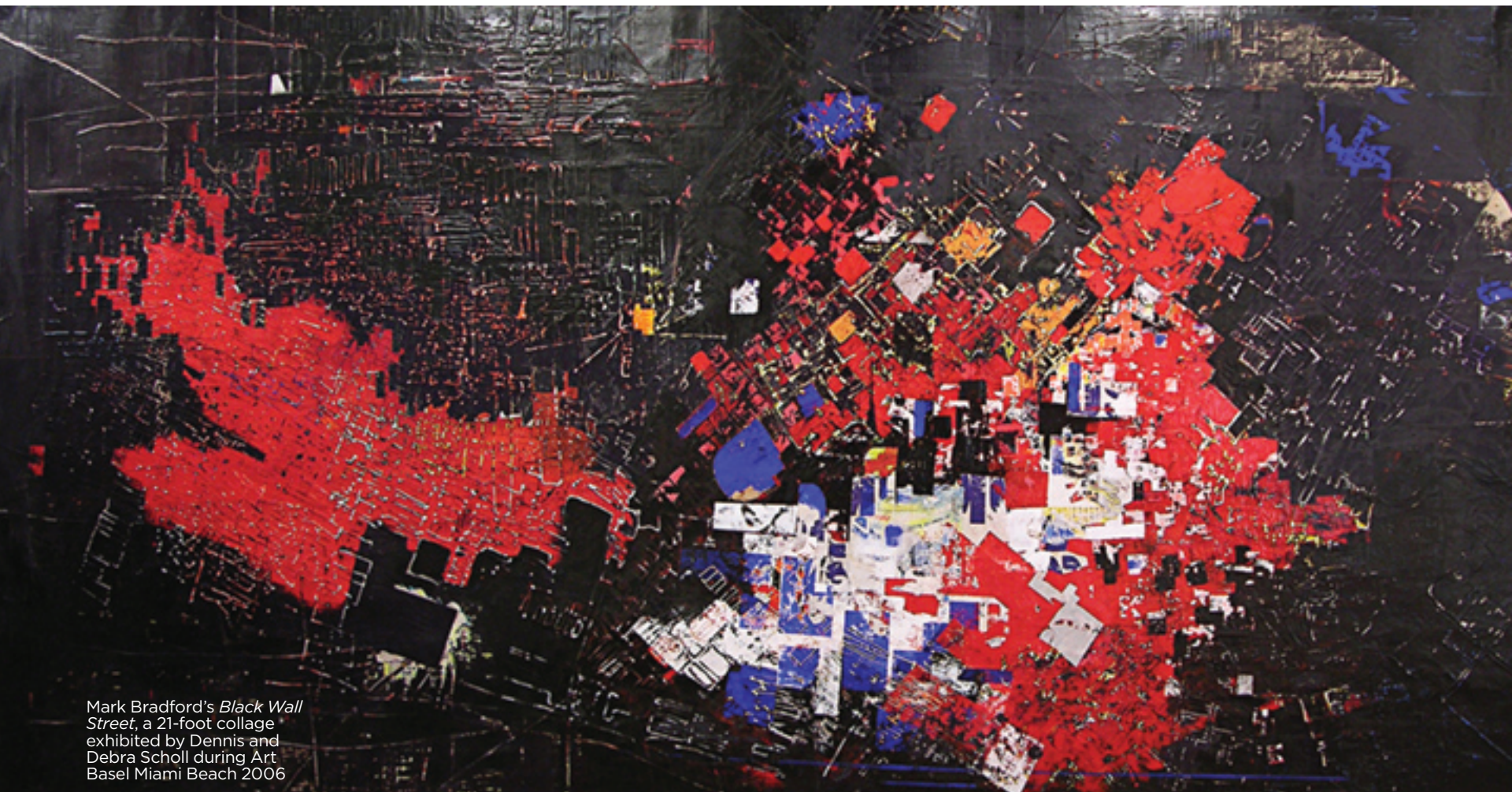
Mark Bradford's Black Wall Street , a 21-foot collage exhibited by Dennis and Debra Scholl during Art Basel Miami Beach 2006